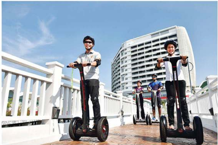
Vouchers can be purchased at Reception Counter and Lobby Shop located at Ground Floor